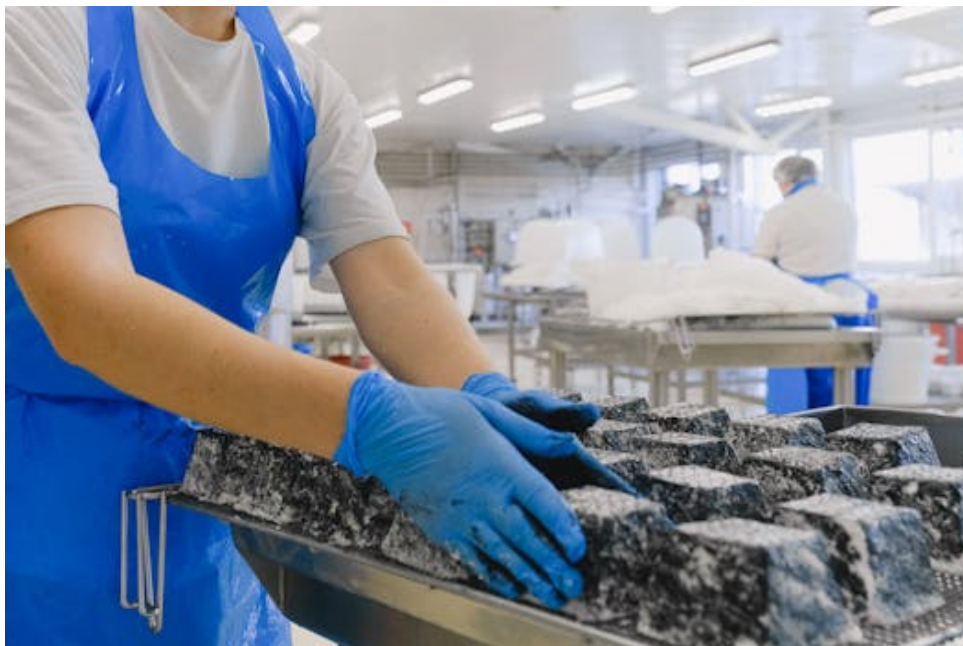
Figure 2: Projected Employment Growth in Montreal Due to New Plant

in the food manufacturing sector in Quebec is approximately $45,000 CAD, which will enhance the purchasing power of the local community.