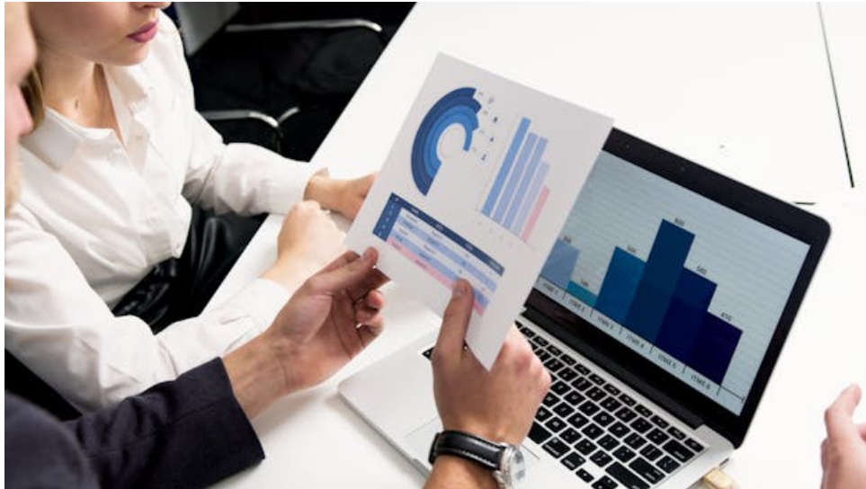
Figure 1: Growth of the Global Pasta Market (2020-2028)

in the food manufacturing sector in Quebec is approximately $45,000 CAD, which will enhance the purchasing power of the local community.